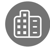
Table of Content